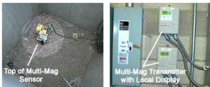
One of West Kern's Multi-Mag Sensors (left) and two of their transmitters (right).