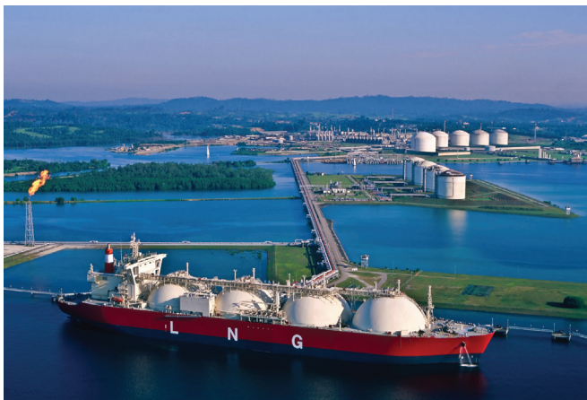
Figure 1: Liquid Natural Gas tanker at port

Over long distances, the safest and most economic method of transporting natural gas is in a liquid state. Plants dedicated to turning raw natural gas into Liquefied Natural Gas (LNG) and later back into gas for distribution are either on-stream, under construction or planned all over the globe. The production, processing, storage, transportation and distribution of Natural Gas all require accurate, repeatable flow measurement.